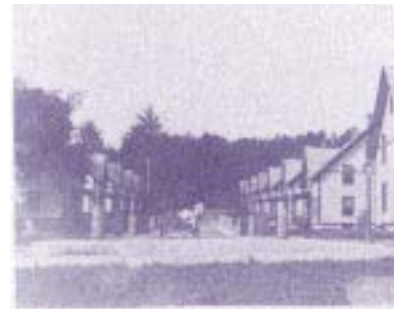
These houses for Whitin employees were built in 1826. Workers with higher status in the mill enjoyed larger, more attractive living quarters than those with lower rank. Eventually, the town contained more than a dozen clearly differentiated levels of housing.