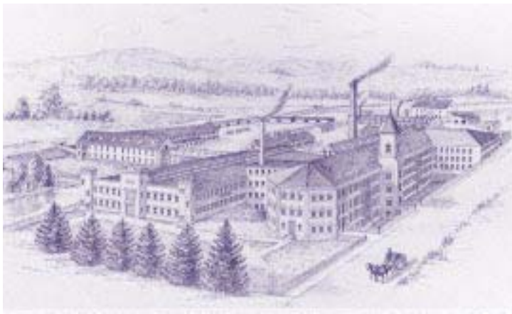
Whitin Machine Works, as it looked in 1879. At its peak in 1948, the complex employed over 5,600 men and women.