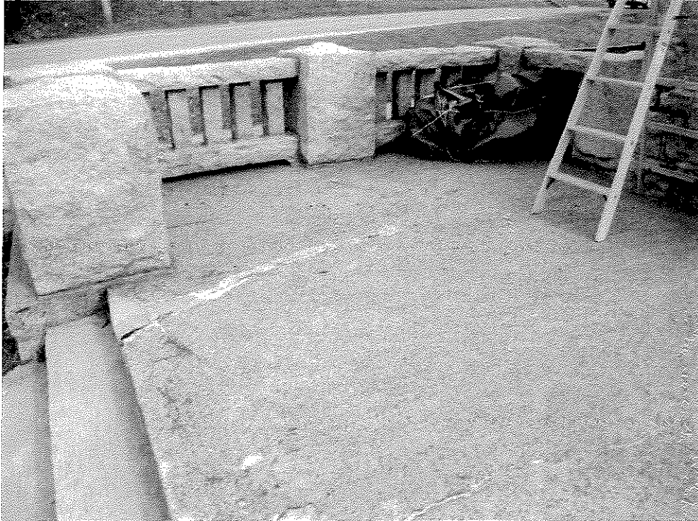
The floor of the monument is cracked in a number of places. An earlier repair was improper, so the failure is both spreading and increasing in severity.