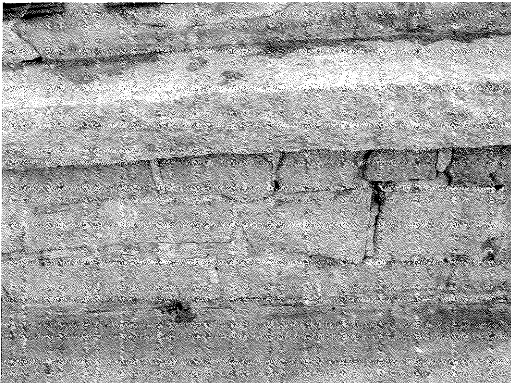
Cracking along the joints is extensive and the old repairs are now also failing.