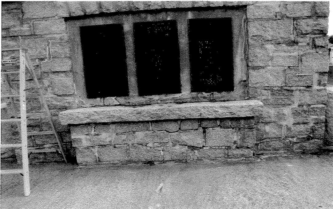
Cracking of the mortar and the concrete is extensive and permits the entry of water. The continual freezing and thawing also accelerates the deterioration of the monument.

The focus of the project is to restore the Rockdale World War I Memorial in Northbridge, Massachusetts. The location of the Memorial is at the corner of School Street and Providence Road. The intent of the project is to maintain the original design and construction of the monument but to disassemble it, provide a new foundation and plaza, and reassemble it. The existing stone monument and balustrade may be of a type such as Milford Pink, Kershaw, or Stony Creek. It is not known at this time if the same granite is available.