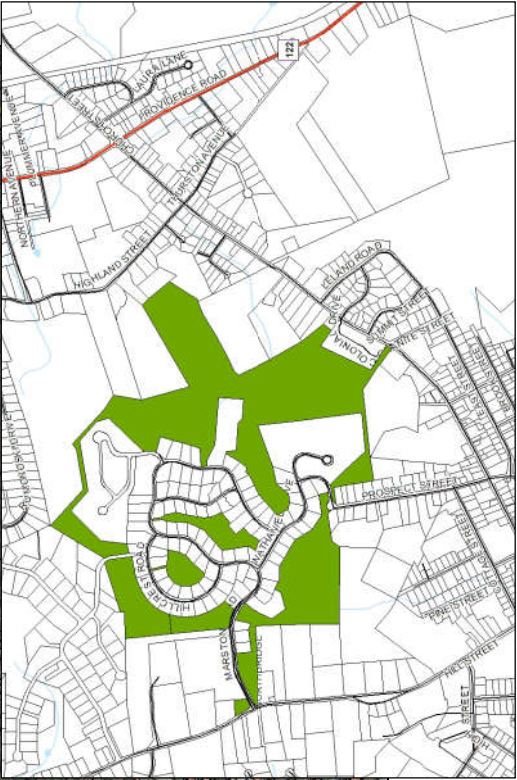
NbridgeGIS –Parcel/Structures/Resource Areas/Ortho –Data layers