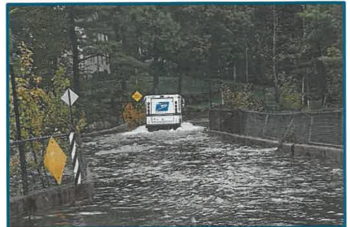
Fig. 1 Flooding event at the Carpenter Rd Causeway