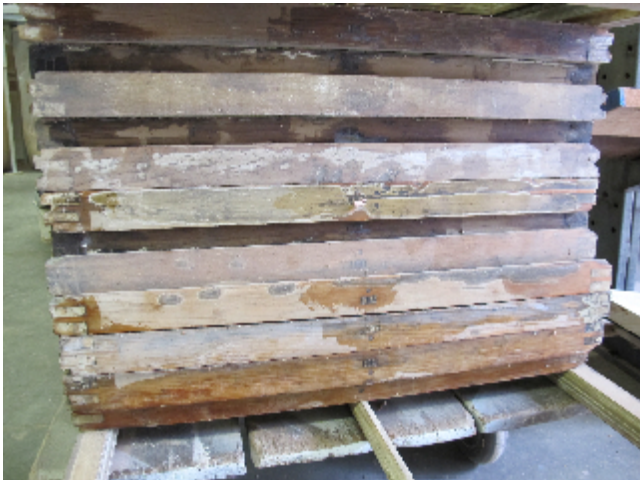
Epoxy repairs made to corner joints & mortise-and-tenon joints of window muntins