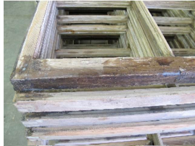
Dark areas of wood on top sash indicate epoxy repairs have been made to that area