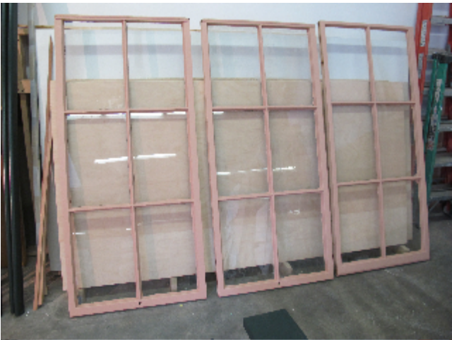
Stripped, sanded, primed & painted sash, ready for finish coat of tinted varnish