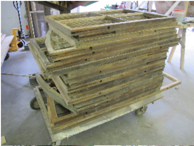
Appearance of sash after being stripped of paint & sanded