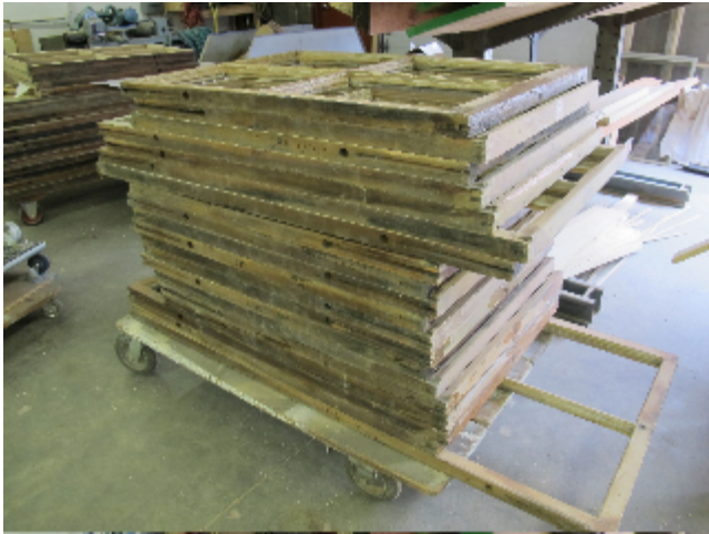
Stacked pile of sash in the production line