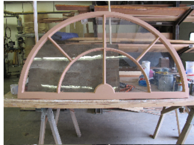
Original glass was salvaged and is being reinstalled to greatest extent possible