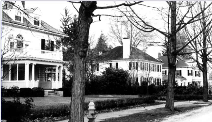
Massachusetts Avenue Historic District, Worcester, both a Local and National Register Historic District

Can a property be designated both as part of a National Register District and as a part of a Local Historic District?